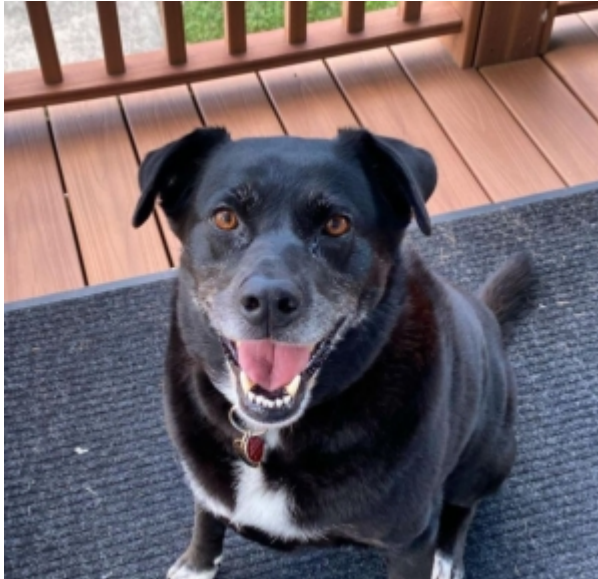
Cate , dog of Allison Fogg , Paralegal